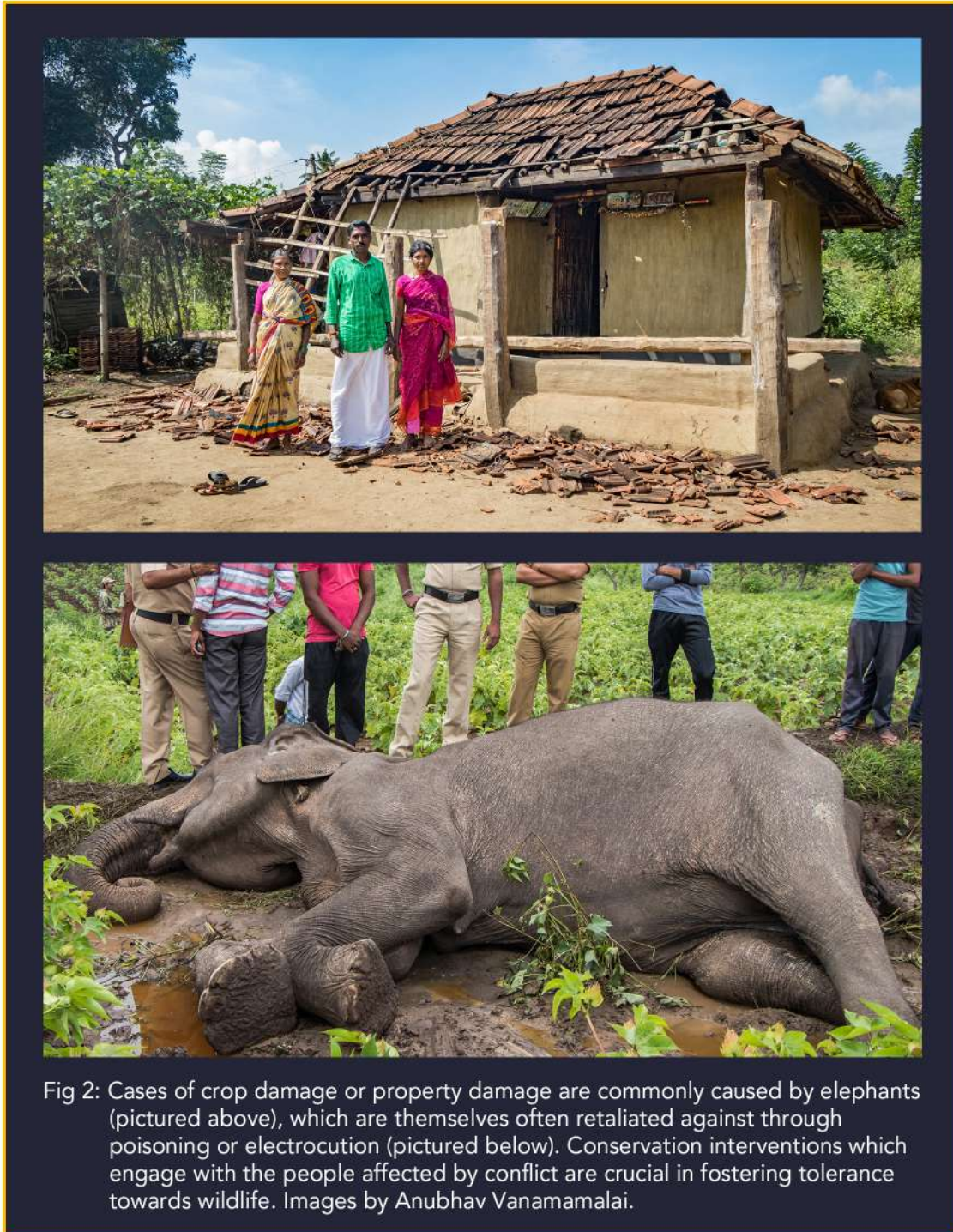
Fig 2: Cases of crop damage or property damage are commonly caused by elephants (pictured above), which are themselves often retaliated against through poisoning or electrocution (pictured below). Conservation interventions which engage with the people affected by conflict are crucial in fostering tolerance towards wildlife.